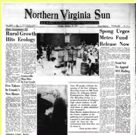
Clockwise from top: October 17, 1971 Northern Virginia Sun article about the opening of the Arlington Recycling Center at 1300 N. Quincy Street; 1974 Wakefield High School poster for Pollution meeting sponsored by the Student Conservation Association; Members of Girl Scout Troop 658 participating in the Cleanarama cleanup effort at Bon Air Park.